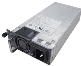
500W POE AC power module