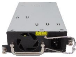
Non-POE AC power module