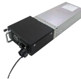
1100W POE AC power module